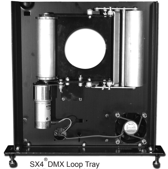
SX4 ® DMX Loop Tray US Patent # 6,926,427 August 9, 2005