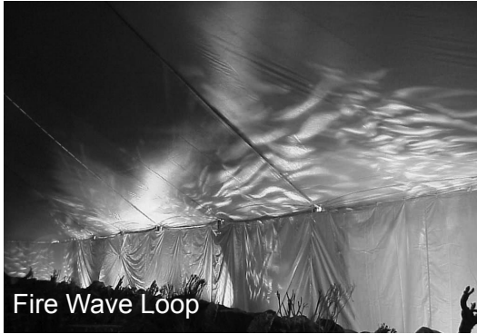
Fire Wave Loop

When using a DMX device with a discharge lamp such as CDM or an HMI, it's suggested that you separate the power circuit for the discharge lamp from the DMX control device. When using DMX controlled units such as an Indexing TwinSpin™ or SX4 ® Gobo Changer or DMX Loop Tray, the "noise" from the discharge lamp ballast may cause some interference and/or damage the electronics. For best results we recommend providing separate line voltage to the DMX devices and the discharge light fixture.